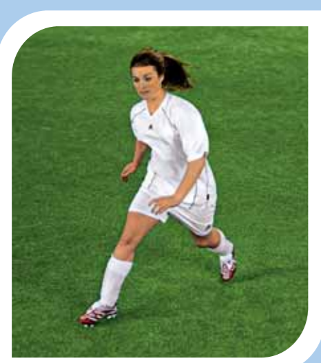
KNEE POSITION CORRECT

Jog 4-5 steps, then plant on the outside leg and cut to change direction. Accelerate and sprint 5-7 steps at high speed (80-90% pace) before you decelerate and do a new plant & cut. Do not let your knee cave inward. Repeat the exercise until you reach the other side and jog back.