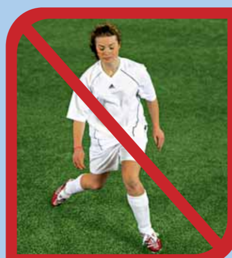
KNEE POSITION INCORRECT